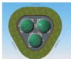
IWOX ® Premium & Standard